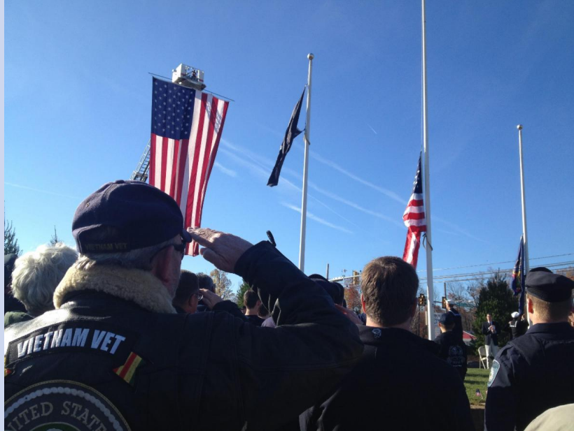
2023 PSATS General Session, Hershey Lodge