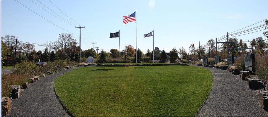
Veterans Park, Plumstaed Township