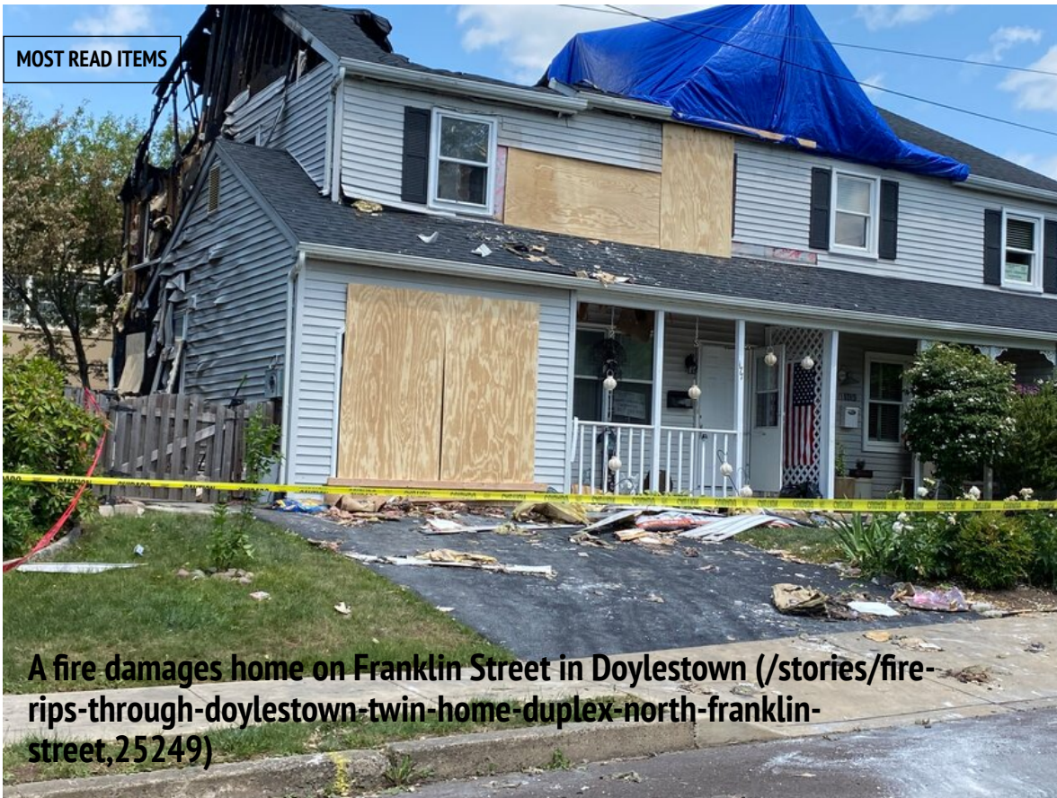
A fire damages home on Franklin Street in Doylestown (/stories/fire-rips-through-doylestown-twin-home-duplex-north-franklin-street,25249)