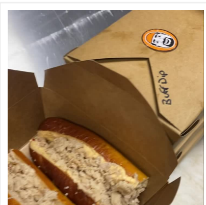
Jay's Steak & Hoagie Joint - (215) 741-6555

The original of all the dip sandwiches!! Buffalo chicken dip cheesesteak!! #jaysjoint215 #buffalodip #cheesesteaks #pretzelroll